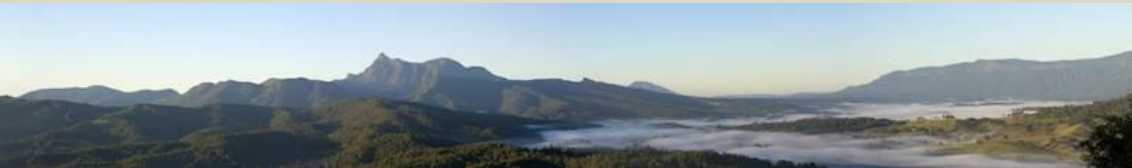
Limpinwood mist